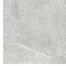
PIETRA ANTICA CENERE PR8080LB