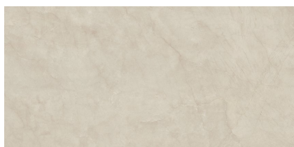
CLASSIC CREAM NATURAL P6012L